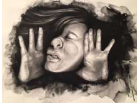
Above artworks from TOP ARTS exhibition