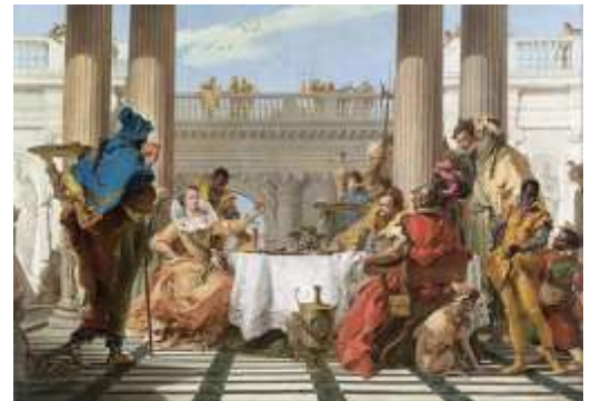
Tiepolo, "The Banquet of Cleopatra", Oil on Canvas, 1743

We stopped for lunch in Fed Square and then made our way to the NGV International where we did a second VTS session of the famous Tiepolo painting, "The Banquet of Cleopatra". Again we were really impressed with the observation skills of students and the creative ideas they had about the story behind the painting. The painting was purchased by the NGV in 1932 for 25,000 pounds and today has been valued well above $100 million.