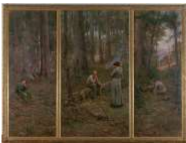
Frederick McCubbin, "The Pioneer" Oil on Canvas, 1904

We did a Visual Thinking Strategies session (VTS) on "The Pioneer" by Frederick McCubbin and students came up with some excellent observations and theories about the narrative of this beautiful painting. We were very proud of their engagement with this process. Can you guess the story behind this work?