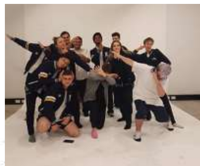
Left: And, of course there was a photo studio so we couldn't resist running a bit of a photoshoot!

Student presentations for their visual communication design studies.