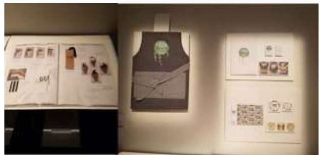
Above: Work from the Top Designs folio exhibition.