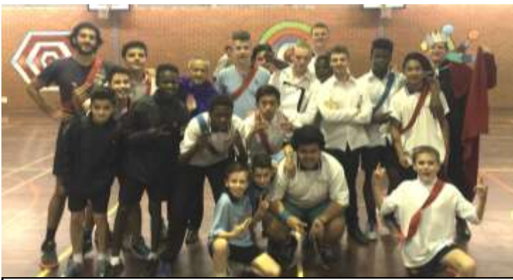
Dalton Dragons drew Scarborough Scorpions