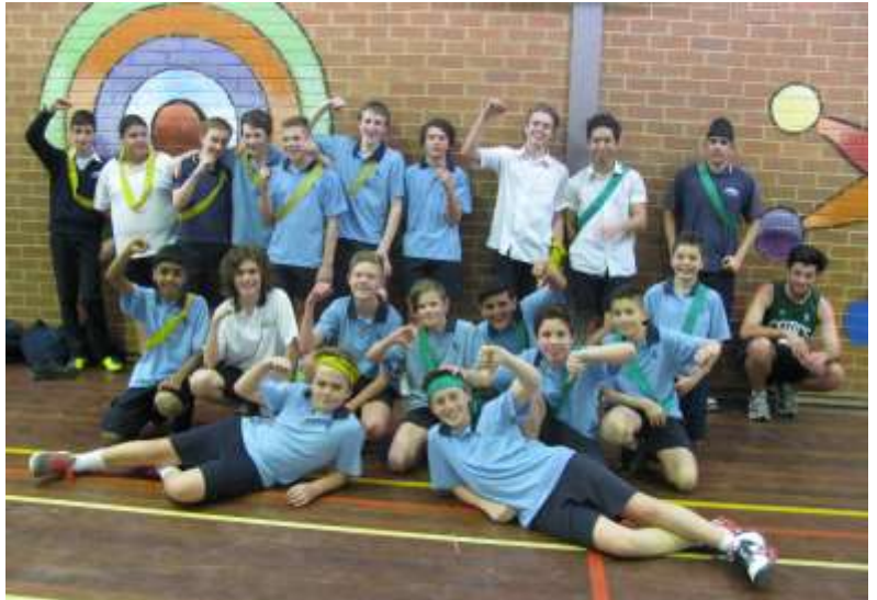
Tatlow Tigers def Findon Falcons

During this term a basketball round robin was held at lunchtimes between the House Teams as a way for students to earn points. Students who participated showed excellent sportsmanship and provided some very entertaining matches for staff and students to watch. Congratulations to those students who earned 10 participation points towards their House's total. The House captains also need to be commended for their enthusiasm and leadership as well as the staff members who have been mentoring them this term. Finally, a massive congratulations to the Tatlow Tigers who won the overall competition and earned 200 points towards their total! We look forward to announcing the overall winner during week 4 of next term.